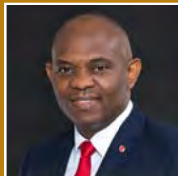
TONY ELUMELU Chairman, Heirs Holdings