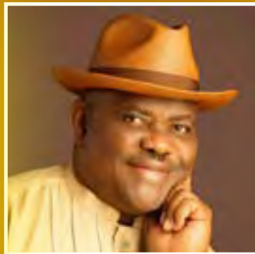
NYESOM WIKE Minister of the FCT of Nigeria Capital Leadership Award