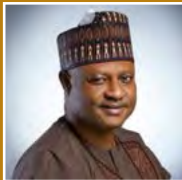
GOV. UBA SANI Kaduna State Governor Frontier Leadership Excellence Award