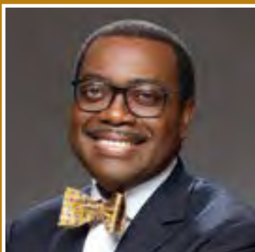
AKINWUMI ADESINA Ex-President African Development Bank