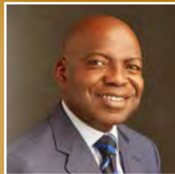
GOV. ALEX OTTI Abia State Governor Peoples Choice Award