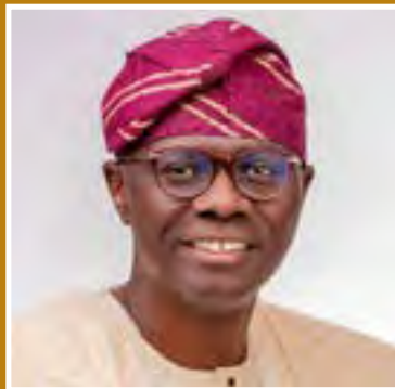
BABAJIDE SANWO-OLU Lagos State Governor Investment & Development Leadership Award