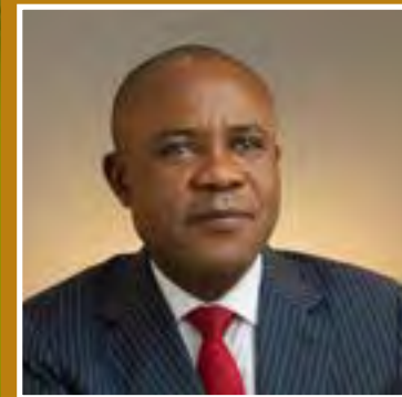
PETER MBAH Enugu State Governor Excellence in Governance award